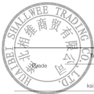
TABLE 5 Tensile Requirements A