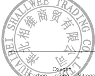
TABLE 1 Chemical Requirements