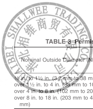
TABLE 3 Permissible Variations in Diameter